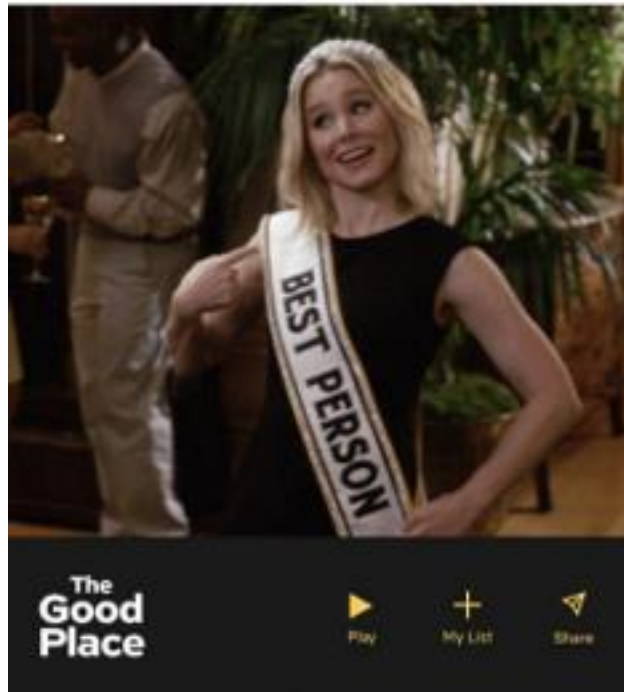
Fig 1. Netflix The Good Place Meme, [online image].

What my wife thinks she looks like the one time she takes out the trash